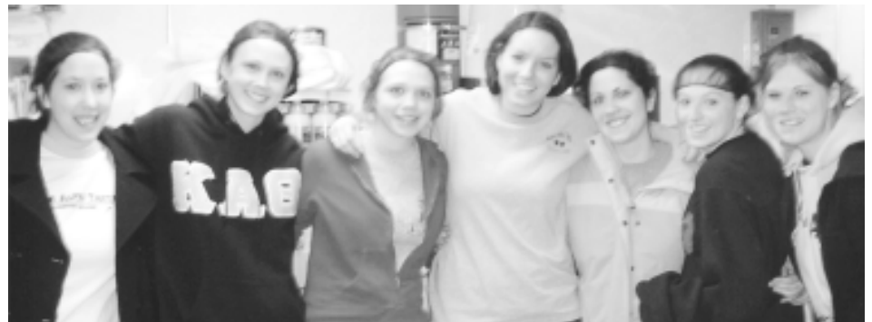
Sisters volunteering at the local soup kitchen, one of several activities Thetas participate in weekly.