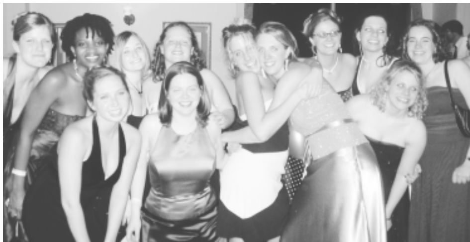
Mu Theta seniors celebrating their last spring formal. Preparing for graduation, our seniors try to enjoy every minute of Theta fun!

The Mu Review is published by the sisters of Kappa Alpha Theta Fraternity at Allegheny College for members and friends. Alumnae news items, photographs and change of address notices should be sent to Mu Chapter of Kappa Alpha Theta, c/o Newsletter Program Headquarters, P.O. Box 602, Needham, MA 02492-0007.