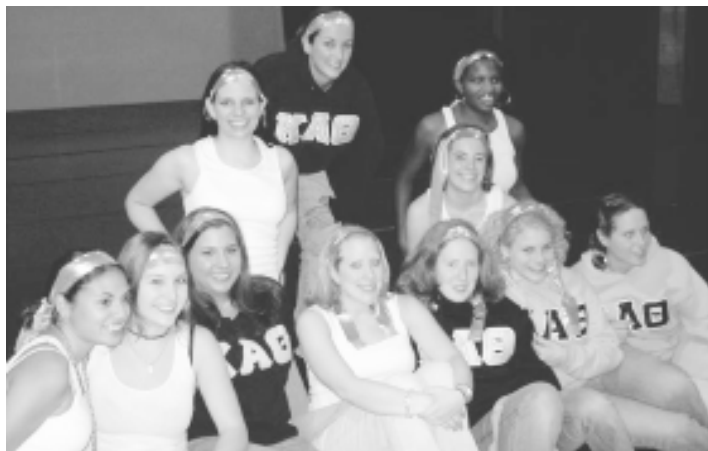
Sisters relaxing before last fall's Greek Sing performance, during which Thetas danced to "Super Greek," our own rendition of Rick James' "Super Freak."