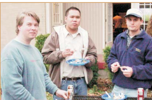
Members and alumni gather at the 8th Annual Theta Chi Homecoming Feast.