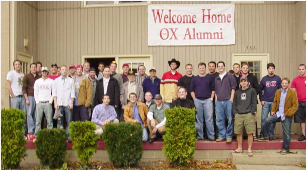
Brothers representing several decades of the chapter's history gather in front of the fraternity house at 388 North Main Street to commemorate homecoming.